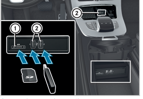
Connecting exterior media sources